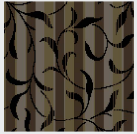
Logan Pattern Repeat: W: 100cm x L: 85.6cm