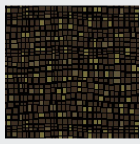
Cobble Pattern Repeat: W: 50cm x L: 38.8cm