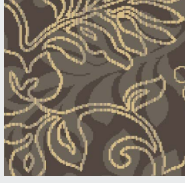
Nouvelle Pattern Repeat: W: 200cm x L: 125.2cm