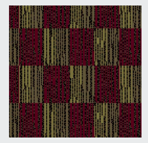
Chess Pattern Repeat: W: No match 4m repeat x L: 26.1cm