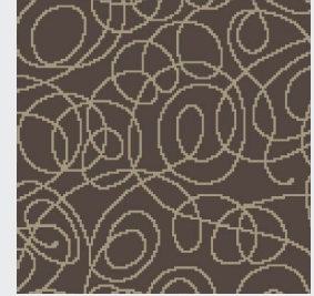
Sketch Pattern Repeat: W: 200cm x L: 68.9cm