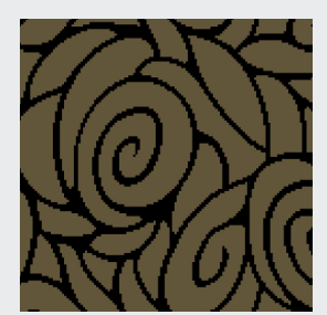
Helix Pattern Repeat: W: 66cm x L: 76.2cm