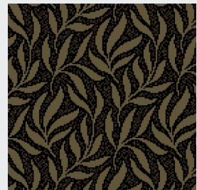
Sophora Pattern Repeat: W: 33cm x L: 39.2cm