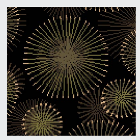
Starburst Pattern Repeat: W: 133cm x L: 66.8cm