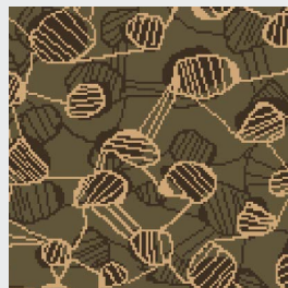
Dodgem Pattern Repeat: W: 133cm x L: 58.8cm