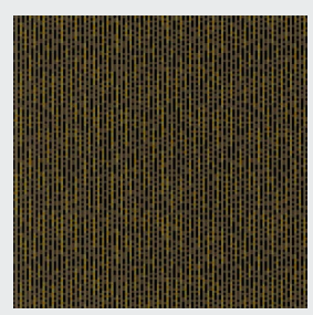
Cord Pattern Repeat: W: 33cm x L: 33.4cm