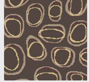
Morph Pattern Repeat: W: 66cm x L: 51.9cm