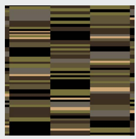
Tic-Tac Pattern Repeat: W: 100cm x L: 45.7cm