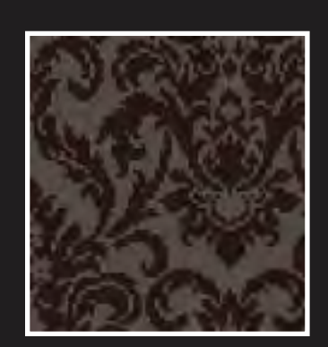
UMBER Design ID: 49-MI 10778F