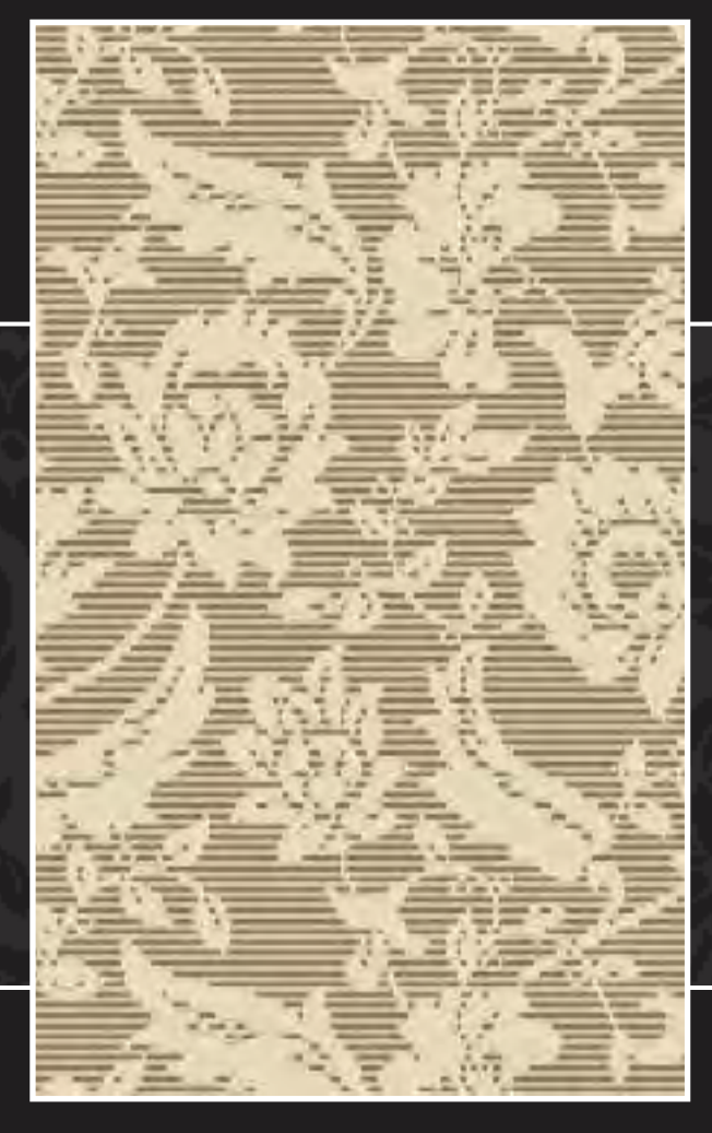
OAK DESIGN ID: 5-M226178F