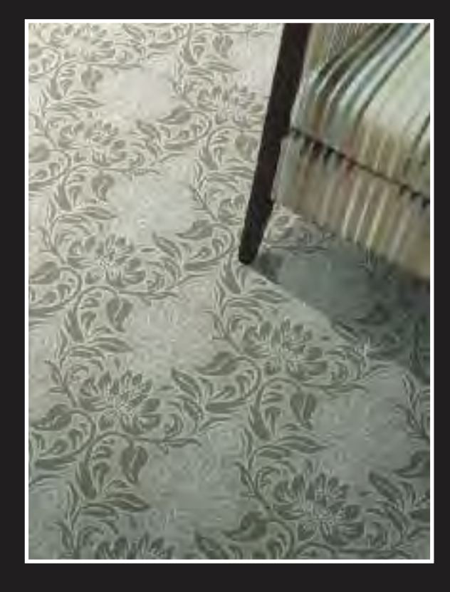
BIRCH DESIGN ID: 7-M268378F