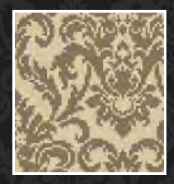
PINE DESIGN ID: 39-MI 10778F