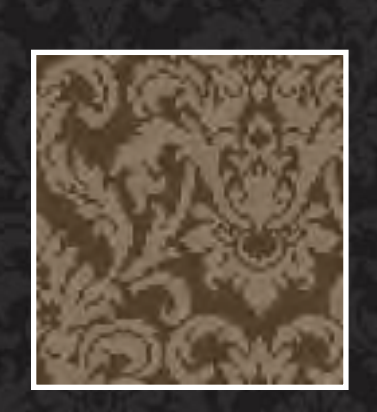
WALNUT DESIGN ID: 36-MI 10778F