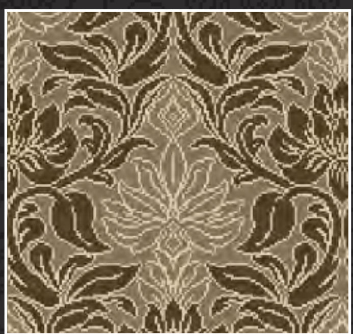
OAK DESIGN ID: 10-M268378F