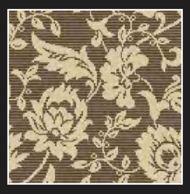
WALNUT DESIGN ID: 4-M226178F